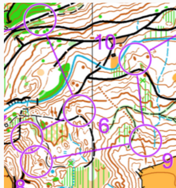
M16 Long Distance course

Luke Bennett was running with 2 of his South East Squad mates in the M18 class and they finished a very creditable 5th.